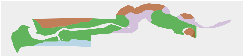
Figure 920: Map of ethnic groups in The Gambia during 1965-1993.