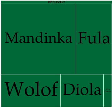
Figure 919: Political status of ethnic groups in The Gambia during 1994-2017.